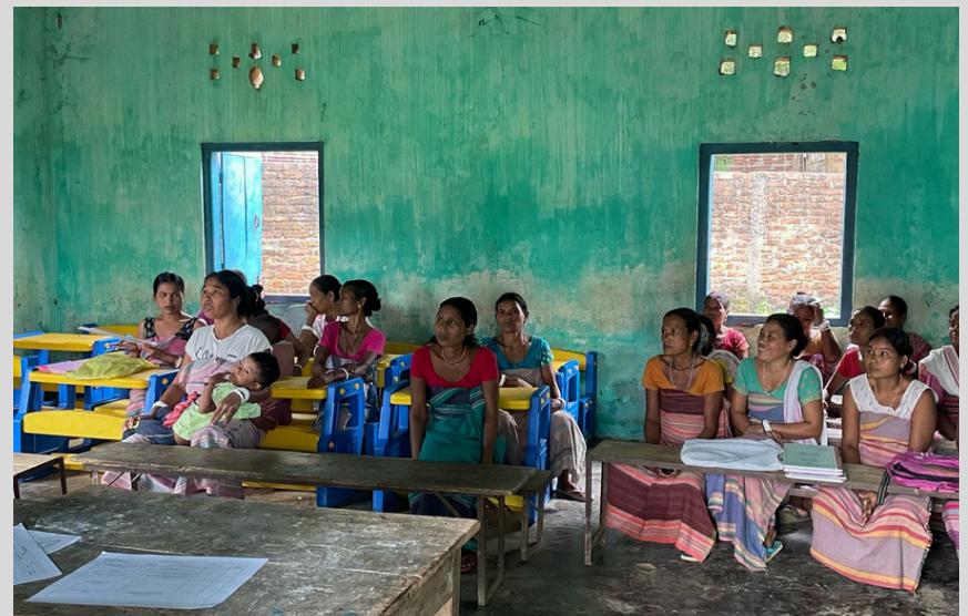
On October 23, 2024, a visit to the VPIC was carried out for SHG re-gradation and discussions on livelihood interventions led by the P A from Zikzak Block. The re-gradation of SHGs continued at Ghilajuri VPIC in Zikzak Block on October 24, 2024.