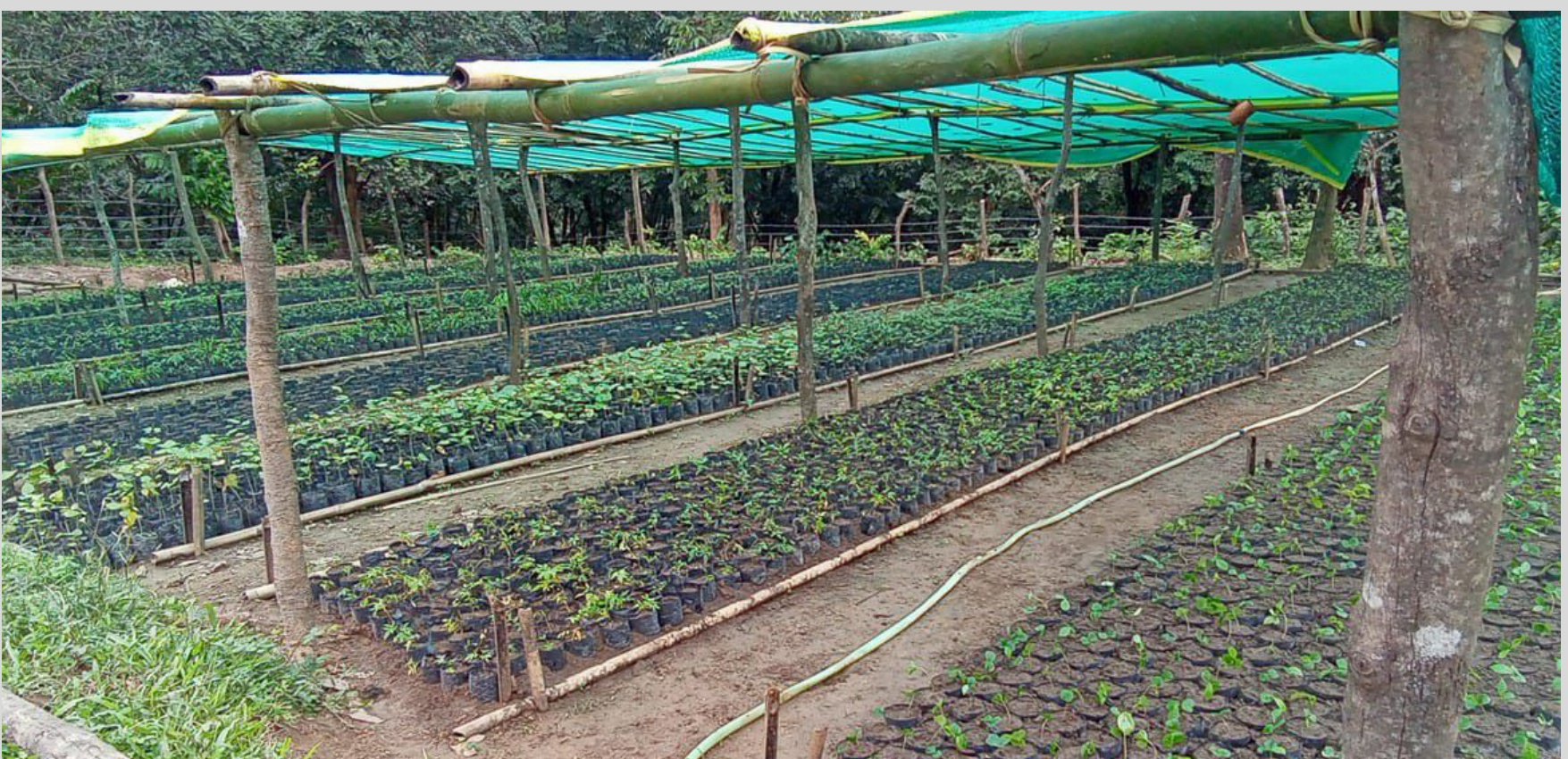
Community Nursery in Soropagre village, Dalu Block