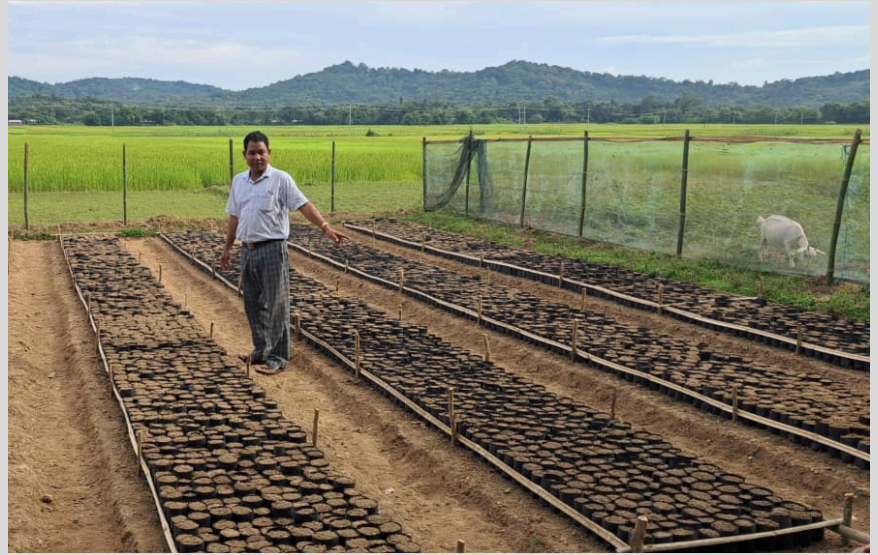
Nursery refilling preparations in Thapa Darenchi village, Resubelpara Block, and community nursery refilling preparations in Zikzak Block.