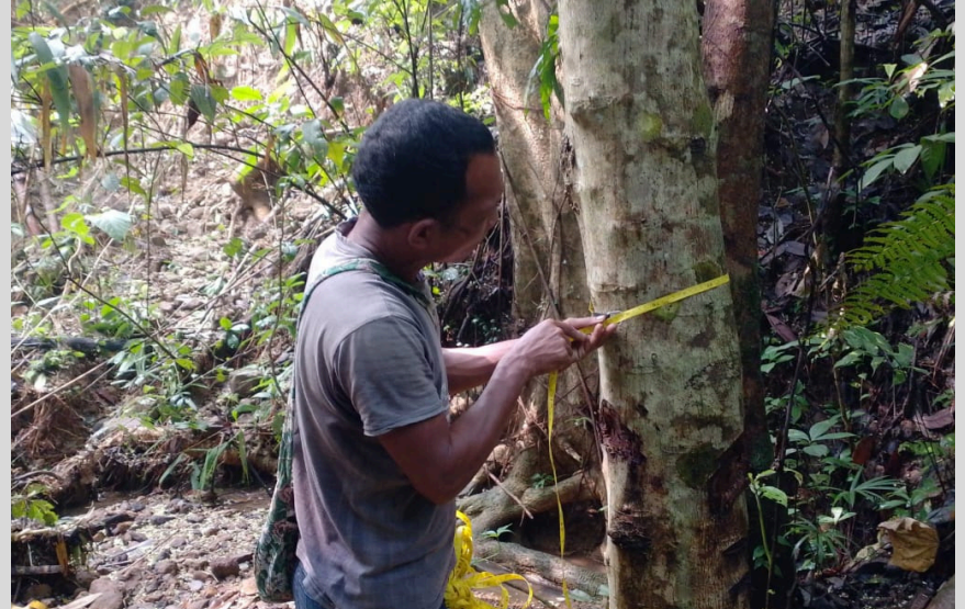
On October 26, 2024, the FMP training for VCF was held at Wakskogre VPIC, and the training was also extended to the Wakskogre VCF.