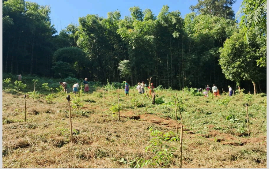
Third weeding at the 2023 plantations in Ajasiram and Thapa Dangre.