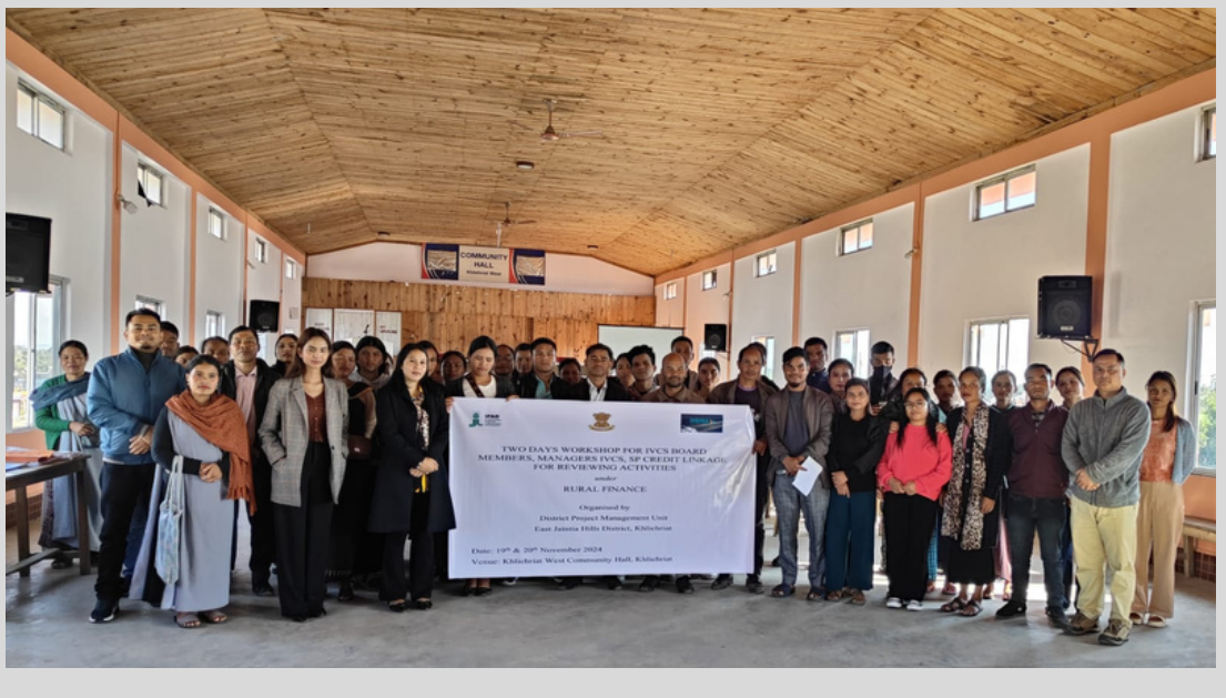
Highlights of Workshops & Meetings

A two-day workshop for IVCS Board Members, IVCS Managers, and SP Credit Linkage was organized by DPMU, East Jaintia Hills District, on November 19th and 20th, 2024, at Khliehriat West Community Hall.