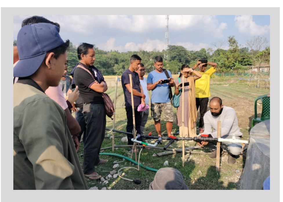
Highlights of Exposure Visits, Inspection and Mobilisation

On November 21, 2024, a demonstration on installing and operating drip irrigation systems was held at a demo plot in Lower Rajapara, South West Khasi Hills. Conducted by a team from Rep Suk Enterprises Pvt. Ltd., the session highlighted the system's functionality and benefits. The program was attended by representatives from various IVCS, aimed at equipping them with the knowledge to manage and utilize the irrigation system effectively in their own demo plots.