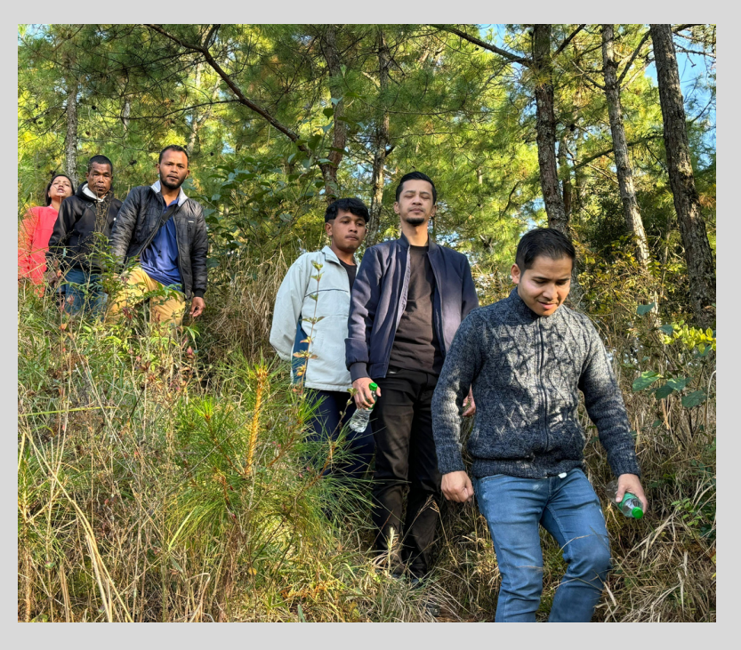
Day 3: The last day of the exposure visit was at Bethany Society to learn about the Vermicomposting, Bokasi Poultry Unit, Vegetable Farming, etc Post lunch the group headed out to Rngi Mylliem Village under Mylliem Block to see water conservation structures such as check dams, plantation area, seed banks, and gabion wall. The day ended with positive responses from the VPIC and VCFs taken from both the Catchments as a part of the feedback during their 3-day exposure visit.