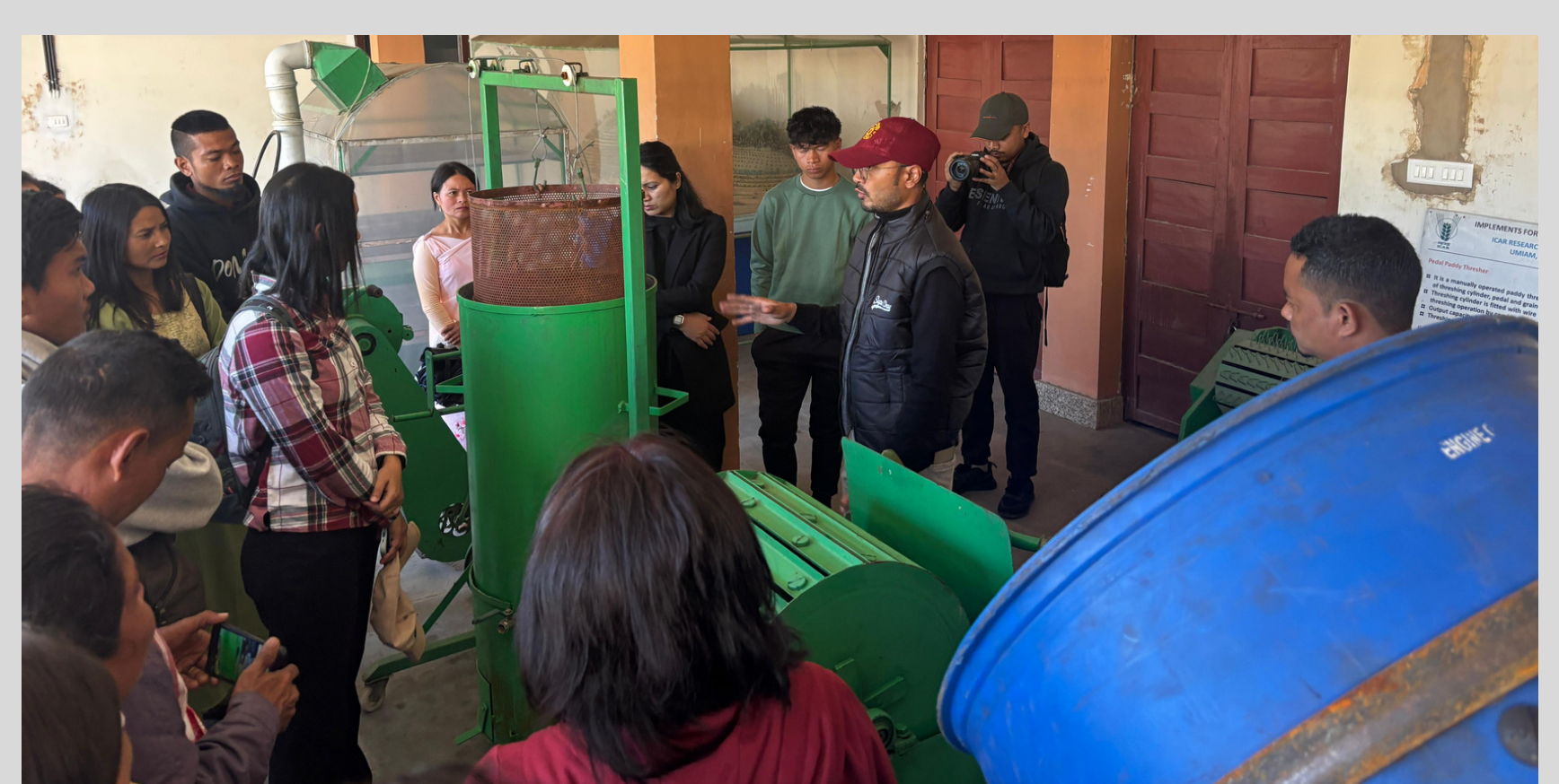
Day 1: Field Visit to ICAR, Umiam, and Fisheries Training to gain insights into engineering interventions crucial for sustainable agriculture and water management in catchment areas including detailed knowledge on advanced agronomic practices, emphasizing soil fertility, crop productivity, and the integration of sustainable techniques in farming systems. Agroforestry (Low Land Site). The day ended Processes and techniques for implementing fishery-based livelihood components. Opportunities for integrating fisheries into the broader scope of sustainable livelihoods.