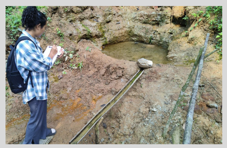
PA GIS conducted spring monitoring activities in Bolsal Dobokgre, Betasing Block, and Zikzak Block.