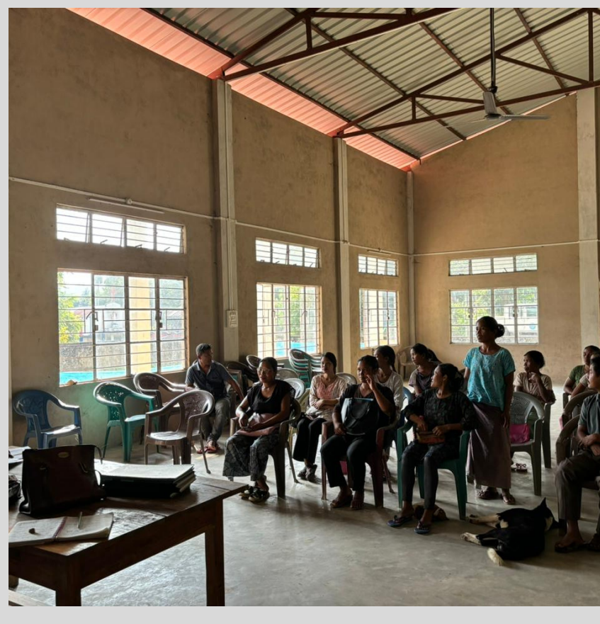
On November 22nd, 2024, the IGA nodal team engaged with 3 SHGs and IVCS members at Malchapara, Betasing Block, focusing on SHG re-gradation, member mobilization, and business planning. This followed an earlier session at Nayapara VPIC, where the team helped SHGs develop strategic business plans for sustainable growth. These efforts are crucial for empowering communities and driving long-term progress.