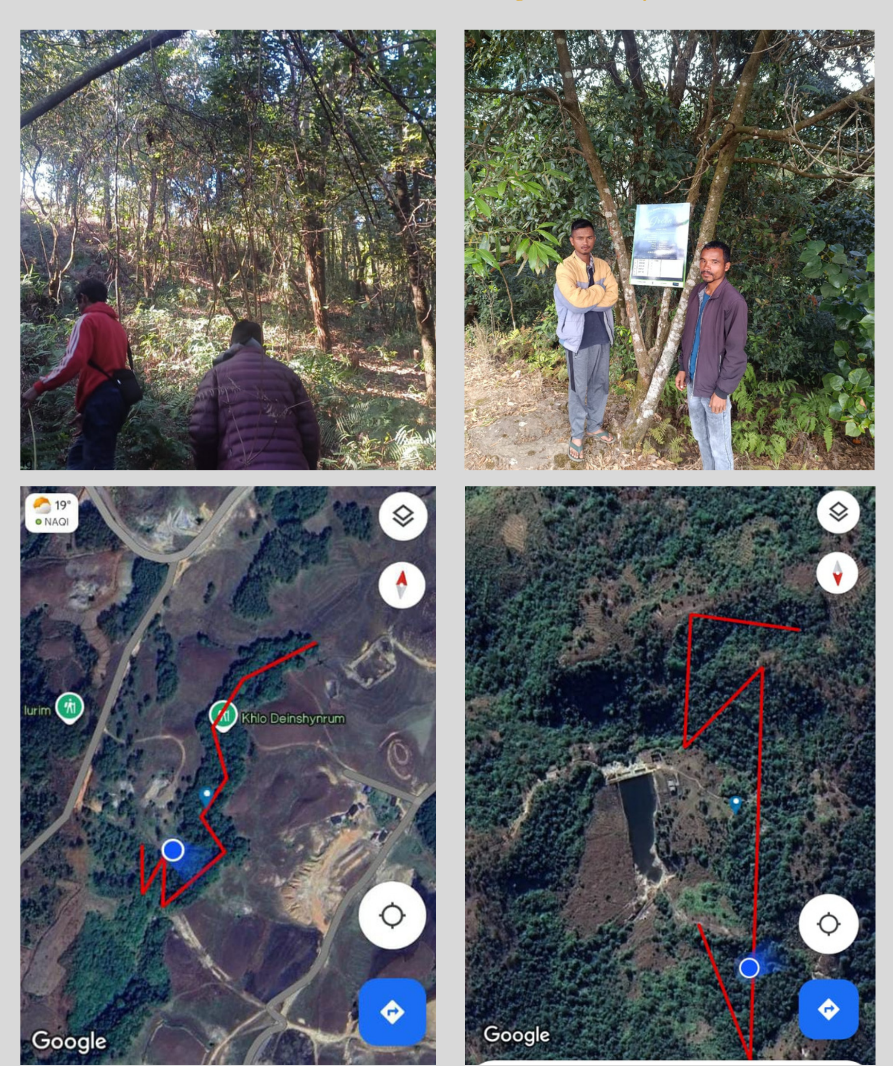
MRV (Monitoring, Reporting, and Verification) in action at Iapmala and Dienchynrum villages