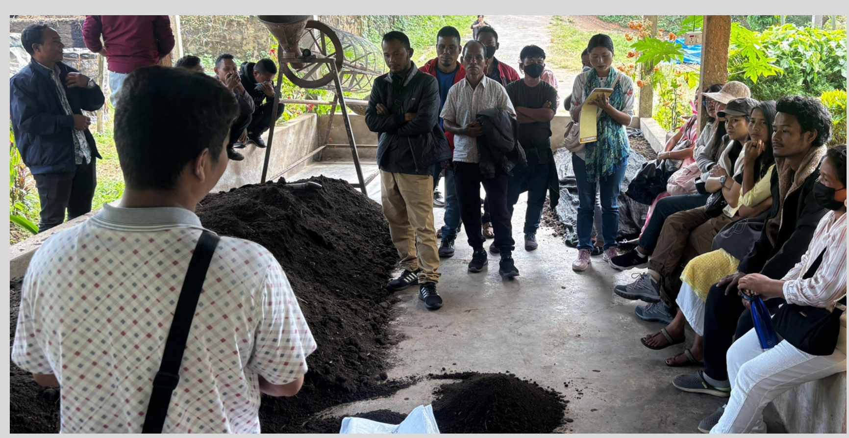
Day 2: Visits to RRTC Centre, Primary Processing Unit, and MegLIFE Plantation Sites the team was introduced to diverse livelihood initiatives, including Nursery and livestock management. Composting techniques to enhance soil fertility. Apiculture and beekeeping for sustainable honey production. Mushroom cultivation holds great potential for income generation. The participants gained practical insights into value-added product creation, including Pickle making. Winemaking. Sweets, jams, and powdered food production.