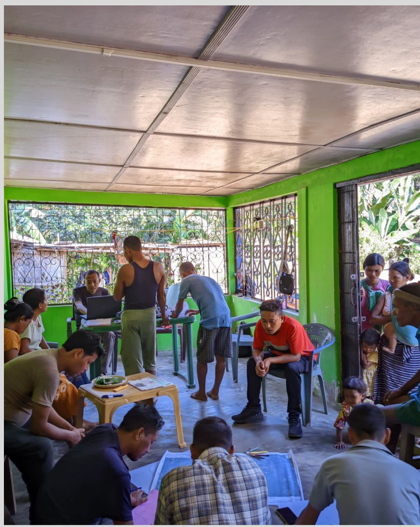
Microplanning activities were successfully conducted at Sanjengpara VPIC, Dalu Block, and Malmua Village, Zikzak Block, SWGH District on November 21st, 2024. Additionally, the Batch-2 micro plan field activities wrapped up on November 23rd, 2024, at Asakgre VPIC in South Garo Hills District.