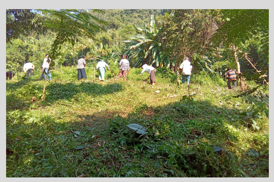
Mulching completed at Thapa Dangre, weeding underway at Thapa Darenchi