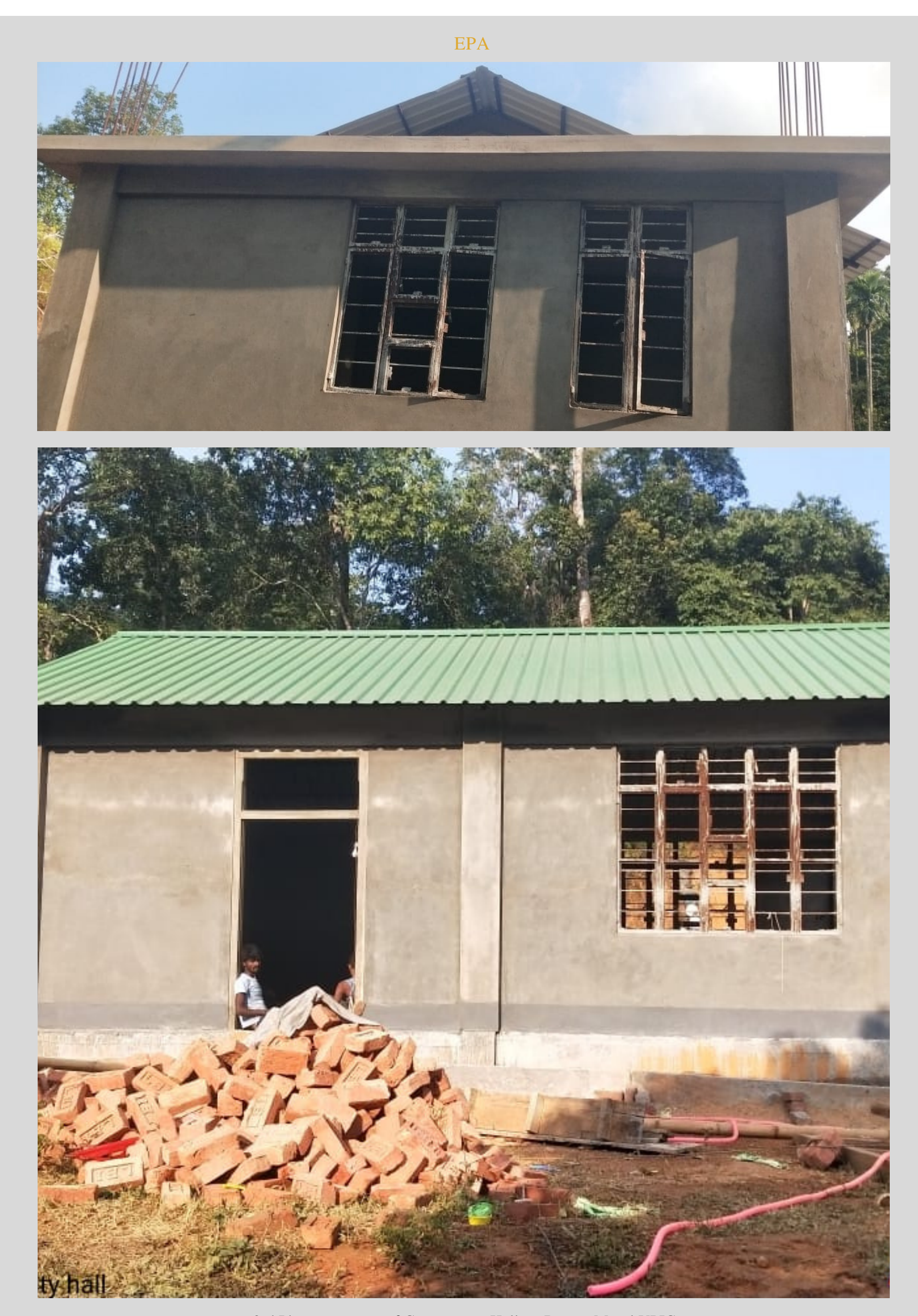
3rd Phase progress of Community Hall, in Bangsi Minol VPIC