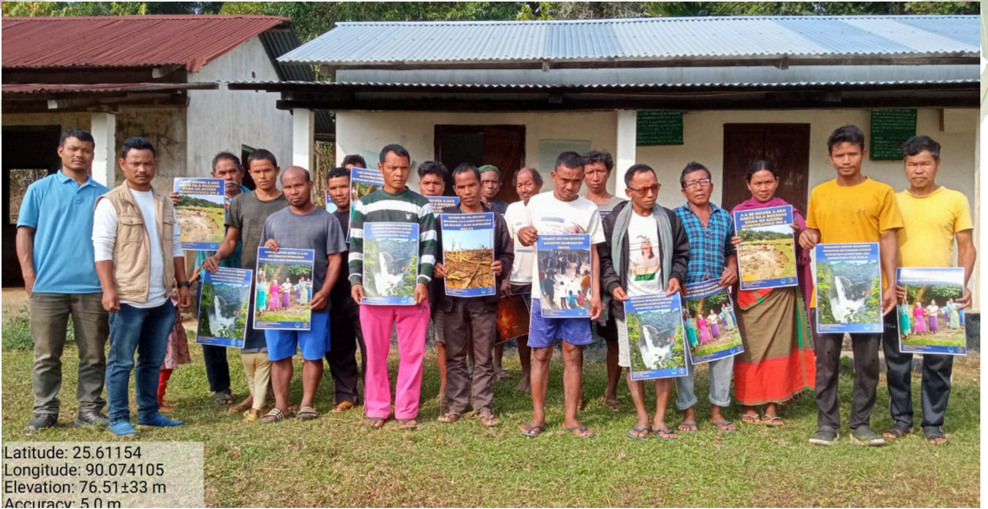
Project Awareness at Rongdikgre village under Rongram Block on 11th Dec 2024