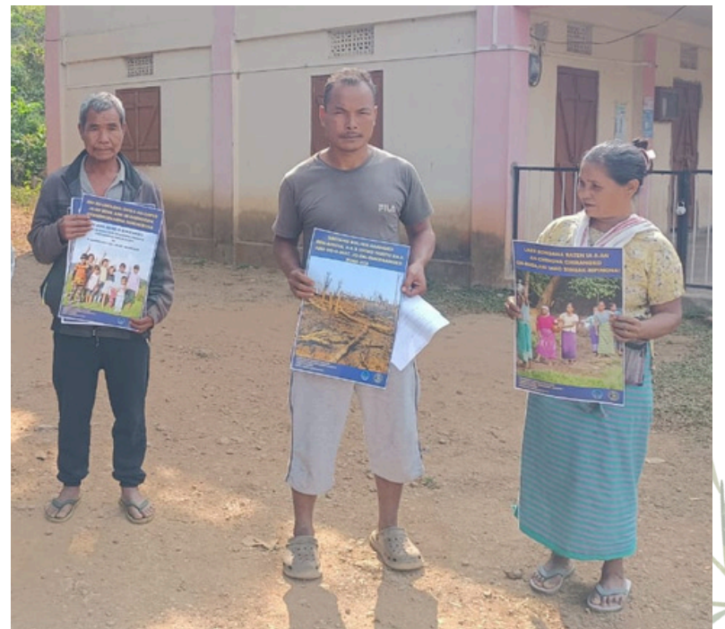
Project Awareness and Ground Truthing at Rongkhon Boldamgre on 13th Dec 2024