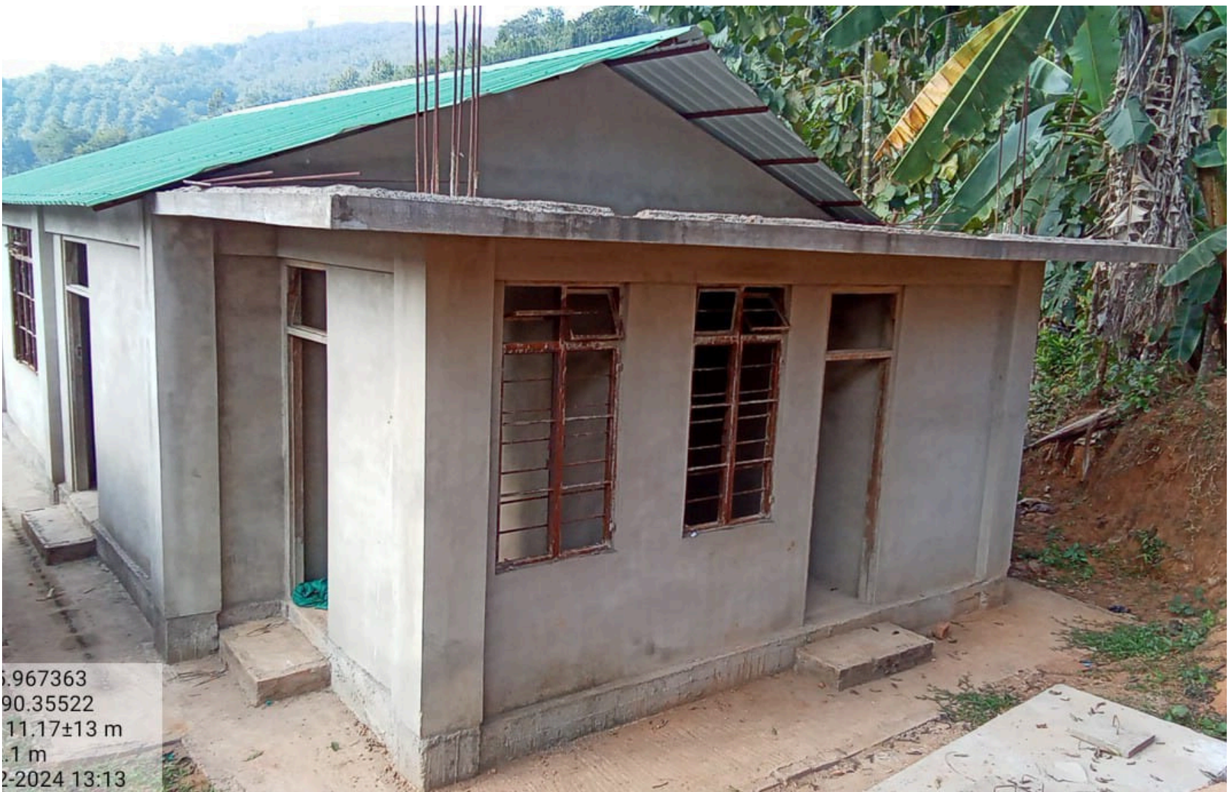
The construction of three IVCS community halls is underway in Tikrikilla block, covering Bawagre, Belguri, and Lower Rembigre villages.