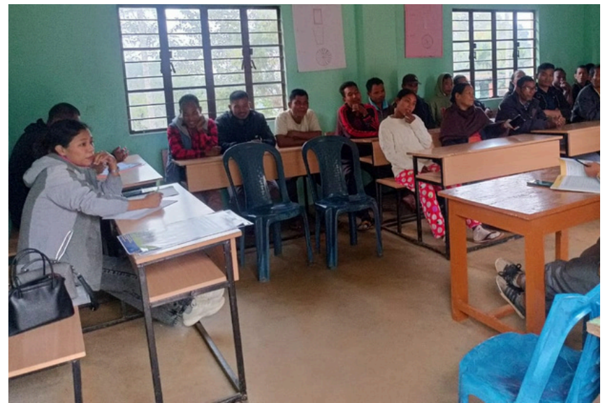
Project Awareness and Ground Truthing at Waram Songma under Rongram Block on the 13th Dec 2024