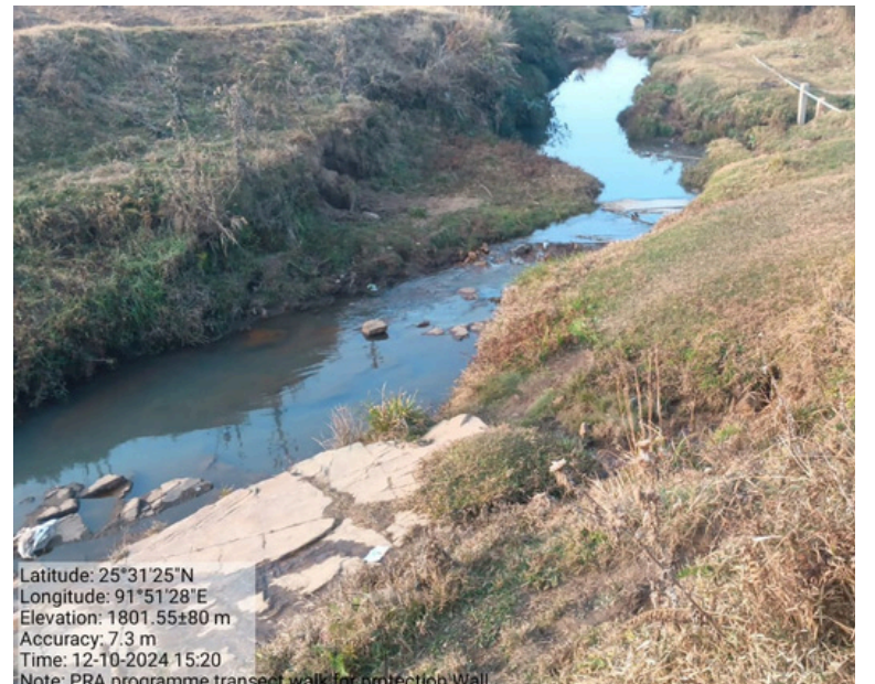
Latitude: 25°31'25"N Longitude: 91°51'28"E Elevation: 1801.55±80 m Accuracy: 7.3 m Time: 12-10-2024 15:20 Note: PRA programme transect walk for protection Wall