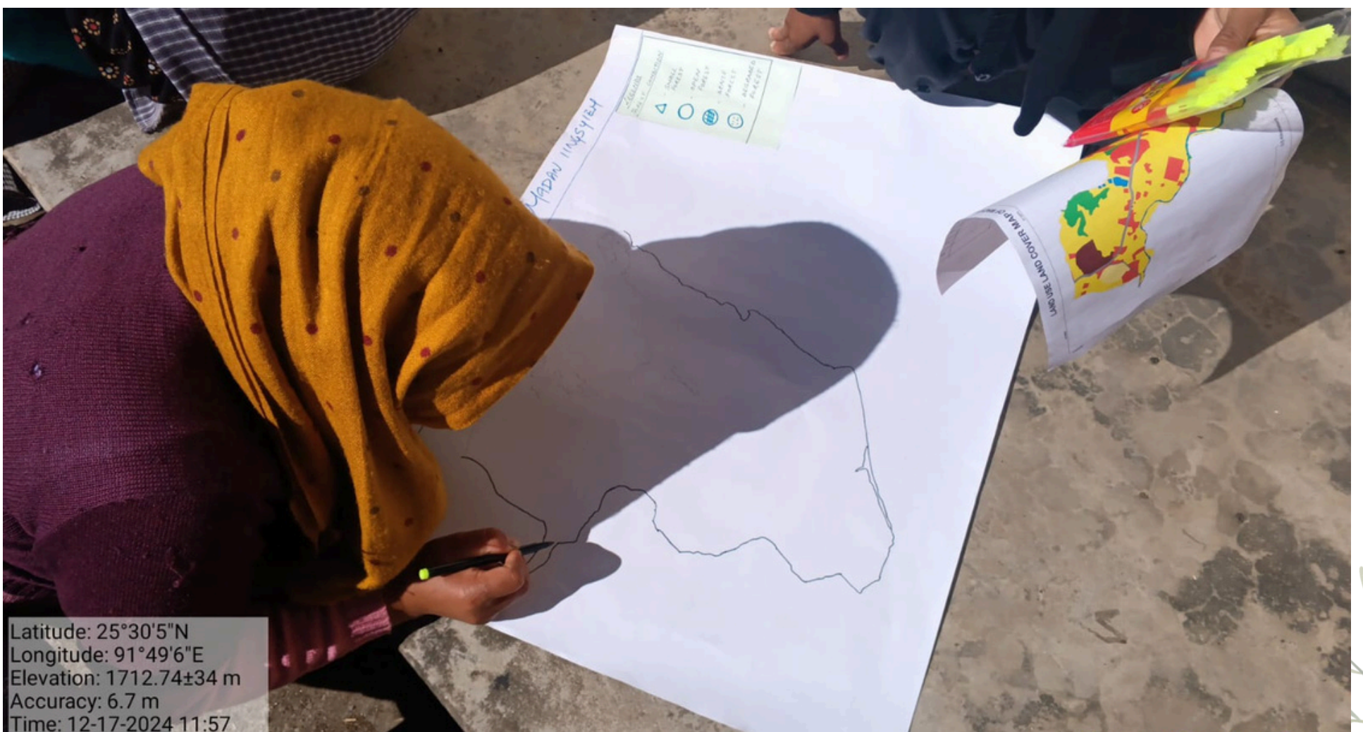
Latitude: 25°30'5"N Longitude: 91°49'6"E Elevation: 1712.74±34 m Accuracy: 6.7 m Time: 12-17-2024 11:57