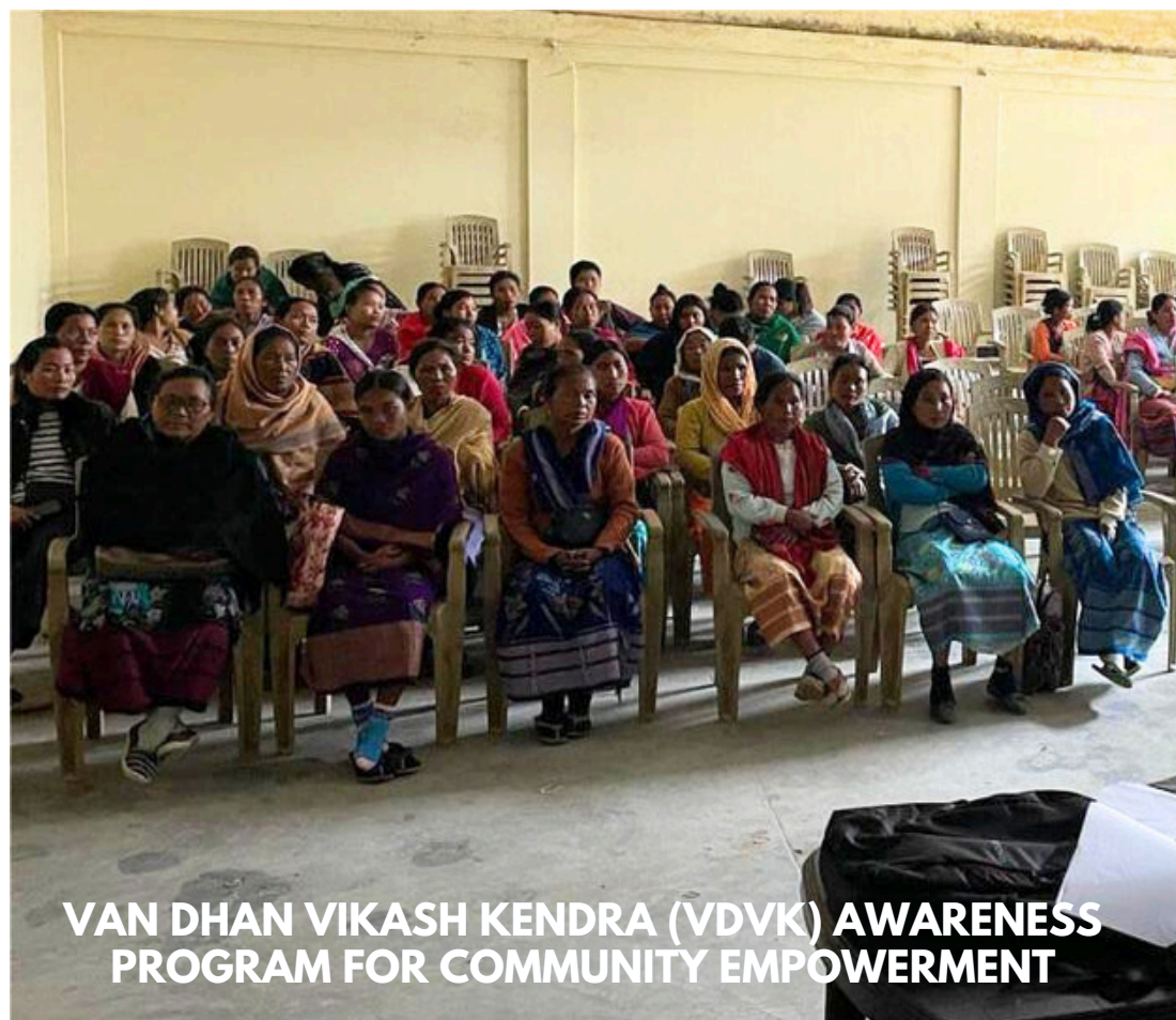
VAN DHAN VIKASH KENDRA (VDVK) AWARENESS PROGRAM FOR COMMUNITY EMPOWERMENT