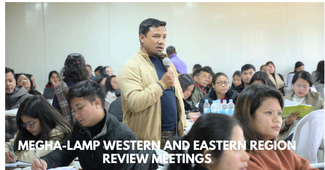
MEGHA-LAMP WESTERN AND EASTERN REGION REVIEW MEETINGS