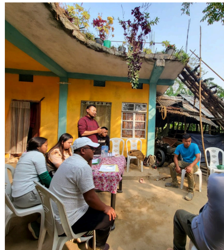
On 21st January 2025, a Veterinary Doctor visited Tilgao IVCS to assess the Piggery and Poultry Bokashi. A team from Goat Trust also evaluated Service Providers to select farmers for Artificial Insemination training. The visit included inspecting ongoing construction work, and Team DPMU reviewed the field demonstration plot and the Processing Unit by Field Engineers.