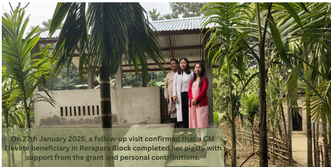
On 27th January 2025, a follow-up visit confirmed that a CM Elevate beneficiary in Rerapara Block completed her pigsty with support from the grant and personal contributions.