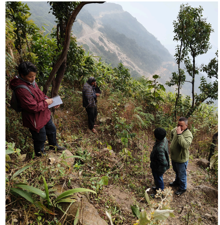
Forest boundary marking at Raid Nongblai in collaboration with the Forest Department team.