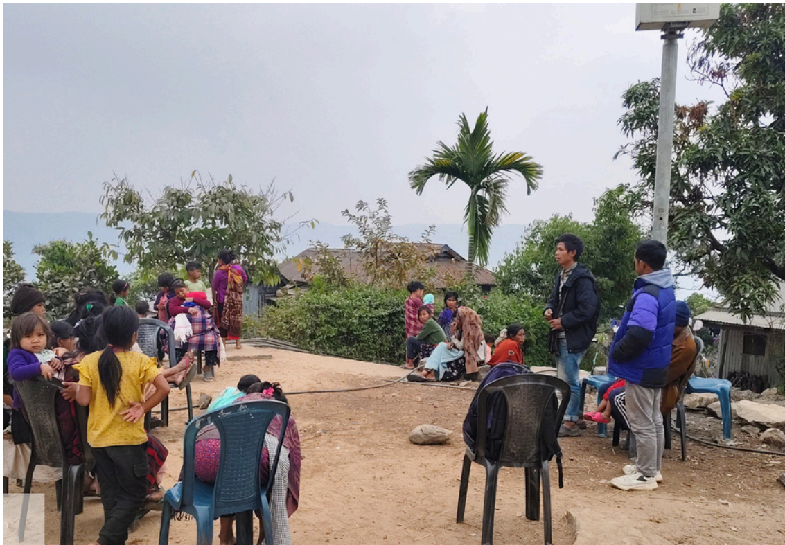
On January 28th, 2025, Green Field Associates held an awareness program in Sder Village, Khatarshnong Laitkroh Block, to introduce the GREEN Meghalaya PES scheme, which supports those committed to conserving natural forests for 30 years.

Forest marking and GREEN Meghalaya Payment For Ecosystem Service (PES) awareness in Sder Village