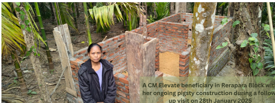
A CM Elevate beneficiary in Rerapara Block with her ongoing pigsty construction during a follow-up visit on 28th January 2025