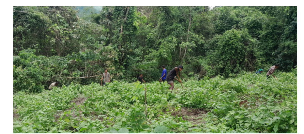
Digging pits underway in Thapa Matronggre village.