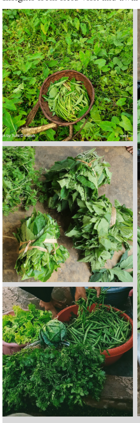
Insights from field visit and awareness programme