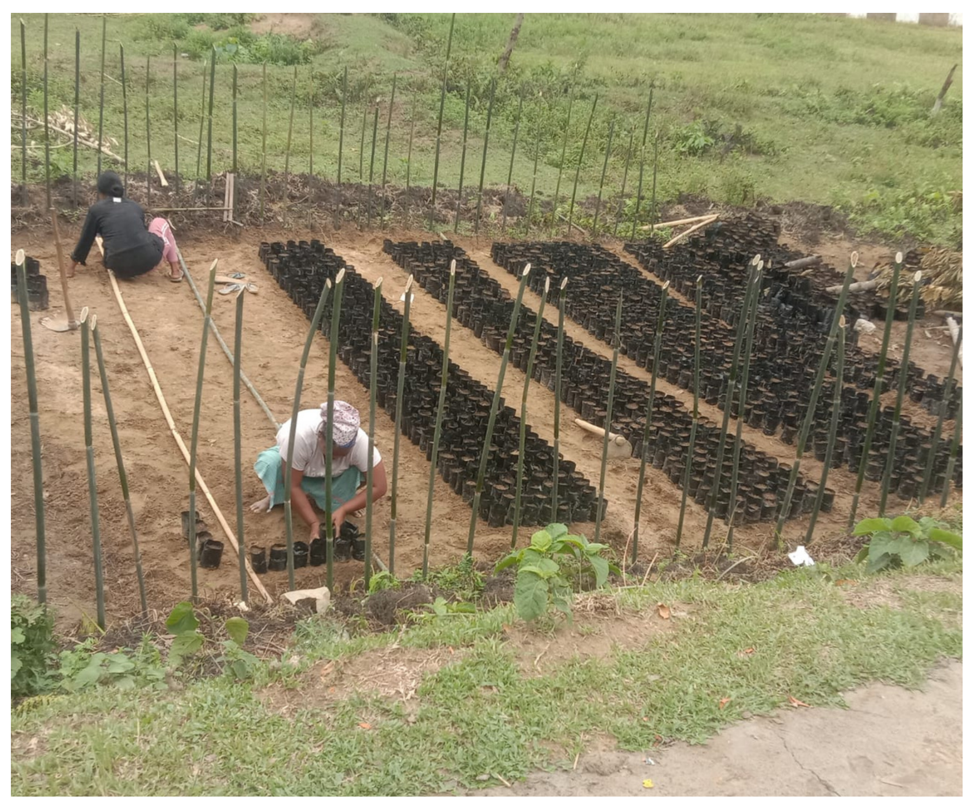
In their second year, Nilwa A'dinggre village has initiated a small plant nursery as part of their PES activity.