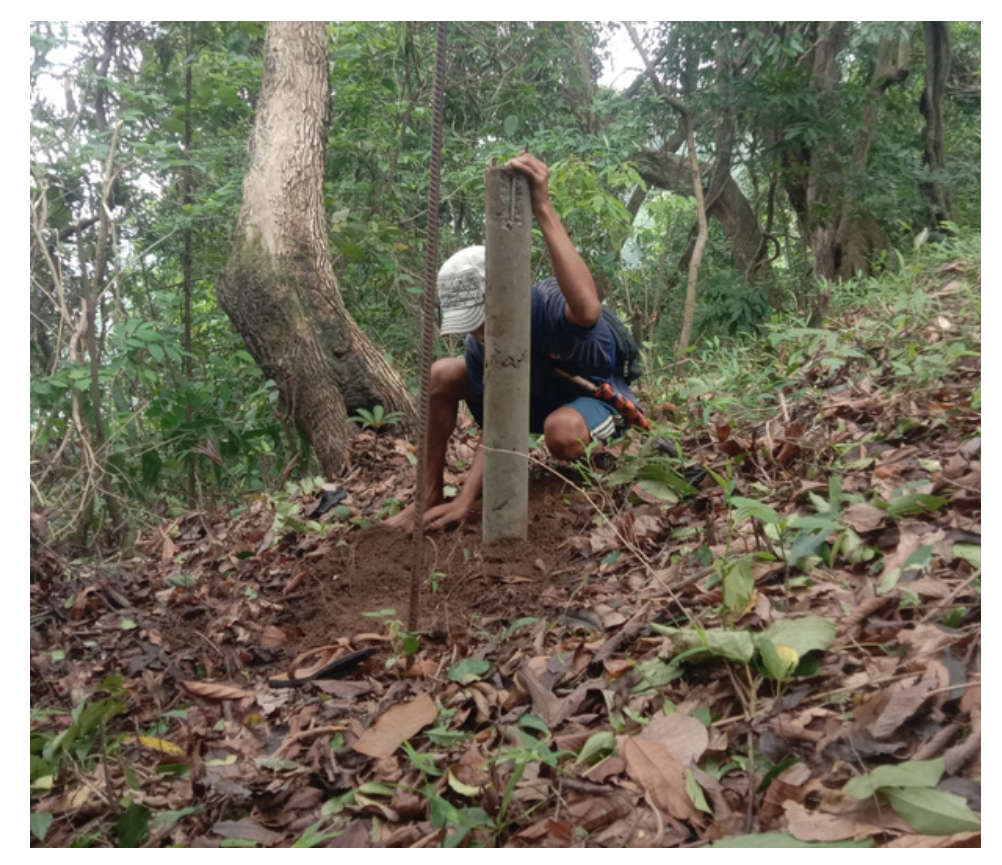
Fencing activities have been carried out at the Abeagre PES reserve, and a boundary fence has been erected around the reserve forest of Nilwa A'dinggre. Additionally, boundary poles have been established around the Eringgre Community reserve forest, and trench-making efforts have been undertaken at the Damdiloka PES.