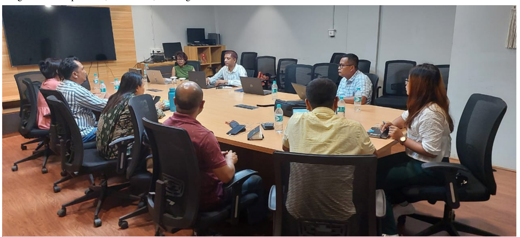
The review with DPMs and Regional Managers of Garo Hills under MLAMP was conducted by HR, SPMU at Prime Hub, Tura on 30th May, 2024. Despite the dreary weather conditions and a prolonged power outage, it did not dampen the spirits of all present, and the review proceeded without any disturbances.

Insights from inspections, field visits, meetings and others