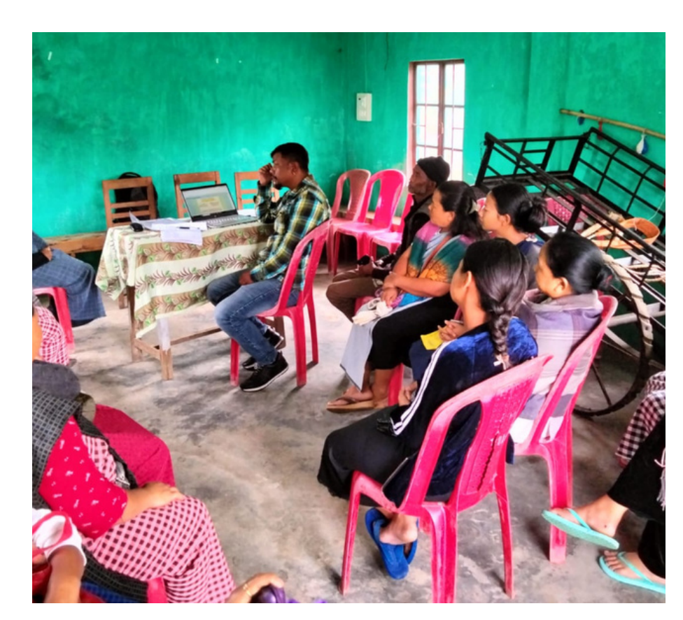
SHG gradation for adoption under MegLIFE IVCS was conducted in Thangshalai village, under #Mawryngkneng Block on June 3, 2024. IVCS aims to provide financial services, particularly savings and credit, to its members, serving as a bank for farmers. Additionally, IVCS acts as a service provider for various stakeholders, facilitating better market access for farmers, #ProducerGroups, and #SelfHelpGroups to sell their produce at higher prices and enhancing market linkages.