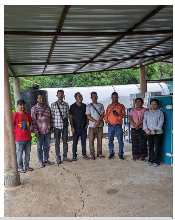
On 30th May 2024, a field visit was conducted to Simkalangre IVCS with the President of the Kholapur District Cashew Traders Association from Maharashtra, the CEO of AceWorx Global from Uttar Pradesh, and the SPMU Team. The purpose of the visit was to survey the volume of production and conduct a thorough examination of the machinery. The visitors also evaluated the drying methods, ensuring that cashews are dried at temperatures between 5° to 6° degrees Celsius to prevent mold formation. Additionally, activities such as nut counting were carried out, revealing that 1 kilogram of cashews contains approximately 200 pieces.